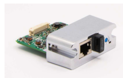
IF2-WF5S PN#: IF2-WF5S IF2-WF5L PN#: IF2-WF5L