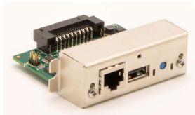
IF1-ES04 PN#: IF1-ES04