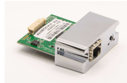
IF2-EFX1 PN#: PPZ60103S