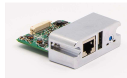
IF2-ES04 PN# IF2-ES04