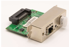
IF1-WF04 PN#: PPZ60108S