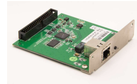
IF5-EFX1 PN#: PPS00488S