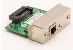
IF1-EFX1 PN#: PPS00338S