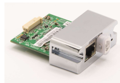
IF2-WF05 PN#: PPZ60112S