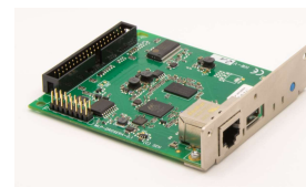
IF5-ES04 PN#: IF5-ES04 (multi-pack) PN#: 2000405 (single unit)