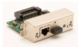
IF1-WF5S PN#: IF1-WF5S